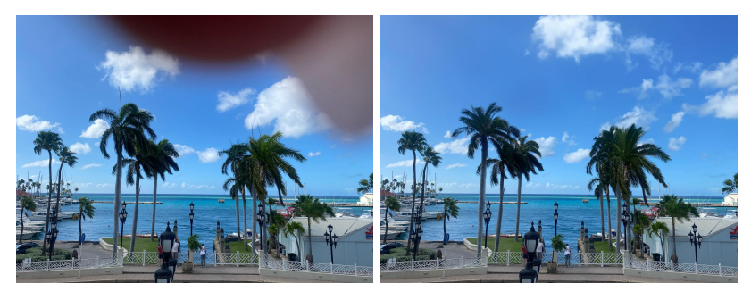
A thumb being removed from a photo in just one click in Photoshop.