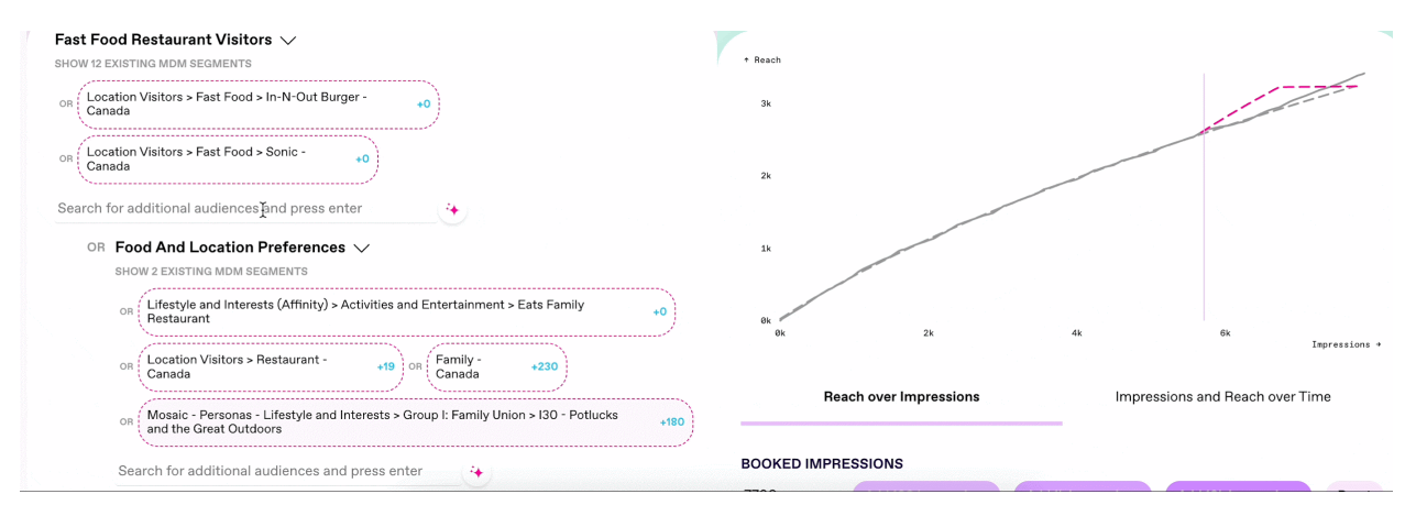
Screen cap of audience discovery and outcome forecasting with AI

Workflow automation can be significantly optimized using AI in campaign creation. By integrating targeting and persona information from briefs directly in natural language or semi-structured raw data in spreadsheets, AI can quickly create campaign setups with appropriate segments and demographics. Further automation allows for real-time adjustments and optimizations, ensuring campaigns are constantly tailored to the most promising audience segments based on dynamic data inputs. Furthermore, by allowing flexibility in constraints, AI systems can optimize campaigns faster over larger datasets, enhancing the overall effectiveness and efficiency of ad spend.