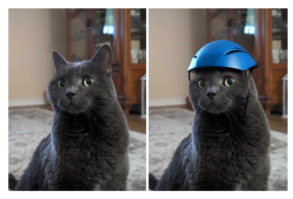
An image of a cat before and after a tiny bicycle helmet has been added to their head using Photoshop's generative fill.

3. Video editing using image generation: Technically savvy individuals with sufficient compute can heavily modify videos frame by frame using image editing. The technical barriers will remain high, but AI powered video editing can open up the opportunity to create unique video content. New tools look to push this field even further with end-to-end text-to-video generation likely coming to consumers this year.