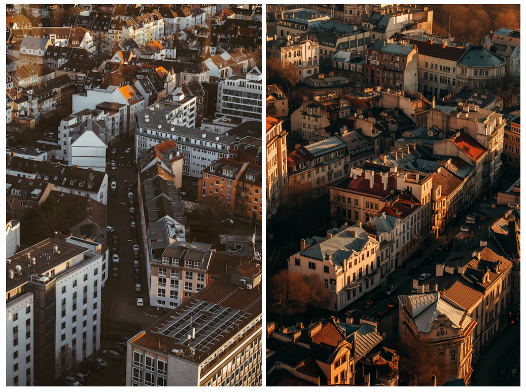
The image on the left is the traditional stock photo taken by Miguel Andres Parra and published for free use by Pexels. The image on the right was created by feeding an AI generated description of the image on the left into MidJourney V6.

1. Image generation : Image generators have the ability to create photorealistic imagery of almost anything the user can imagine. Stock photography of a woman shopping? A background for your product picture? Al image generators can produce these in moments.